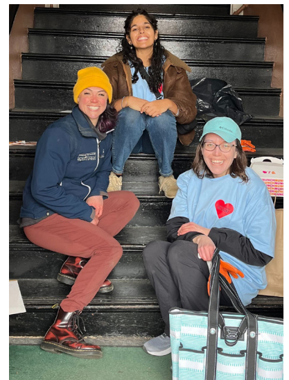
The Emerald Network team planted flowers with Fields Corner Main Streets as part of Mayor Wu's Love You Block event in the Spring.